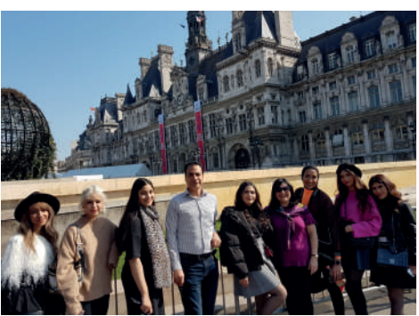
Academic trips to world class cities